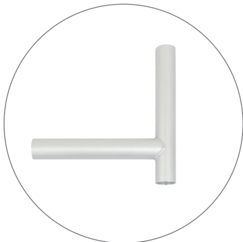
(qty 2) Bottom Corner Connector