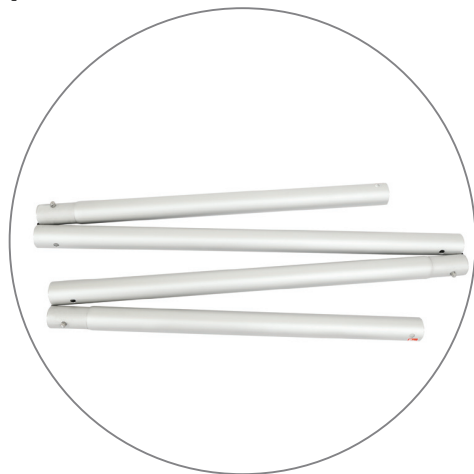
(qty 2) Horizontal tube set