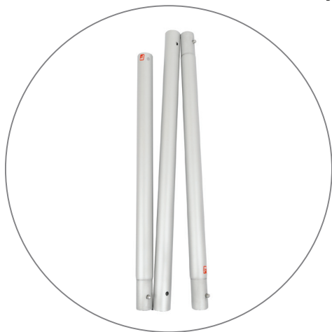
(qty 2) Vertical tube set