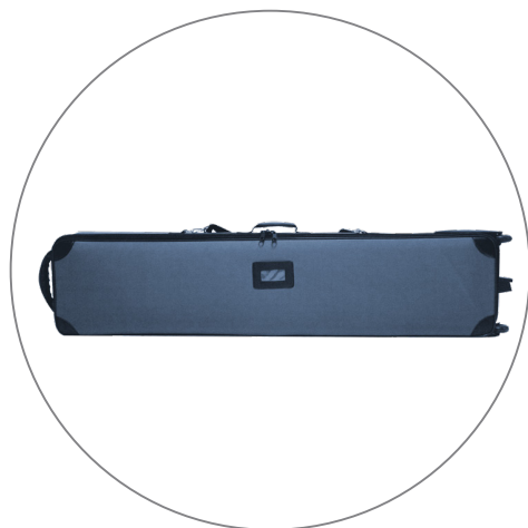
(qty 1) Silverbag