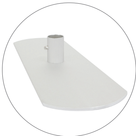
(qty 2) Feet