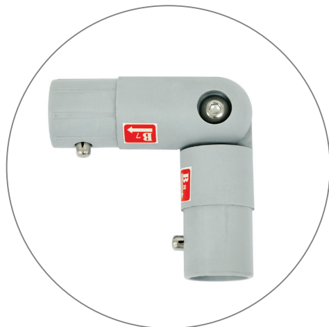
(qty 2) Top Corner Connector