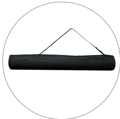
Qty 1 - Travel Bag