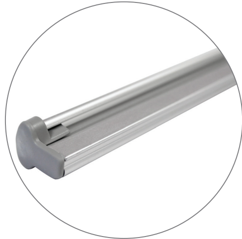
Qty 1 - Clamp Bar