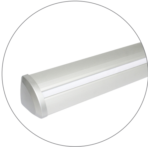
Qty 1 - Cinch Stand