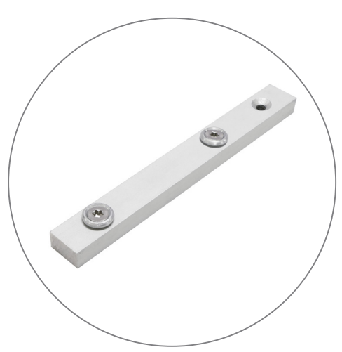
Qty 12 - Split Connectors