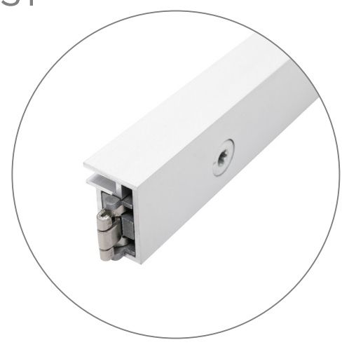
Qty 8 - 40CG Horizontal Extrusions