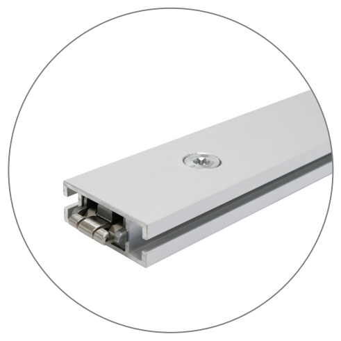
Qty 2 - Support Struts