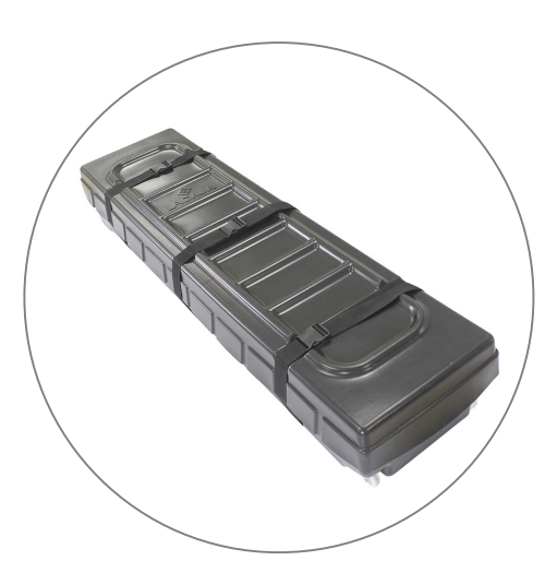
Qty 1 - La Caja Hard Case With Wheels