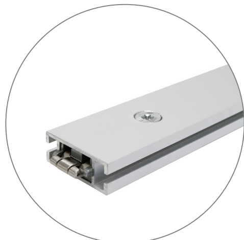
Qty 4 - Split Support Struts