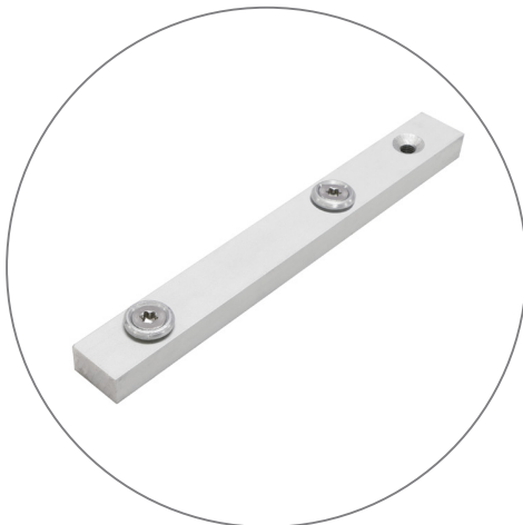
Qty 16 - Split Connectors