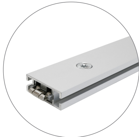
Qty 8 - Support Struts