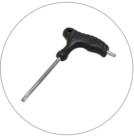
Qty 1 - Torx Key