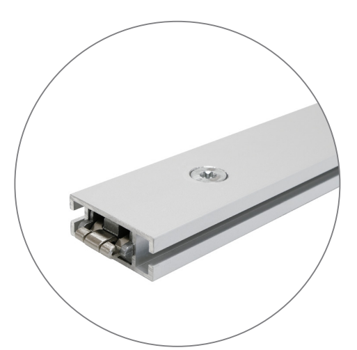
Qty 4 - Split Support Struts