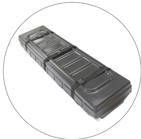
Qty 1 - La Caja Hard Case With Wheels