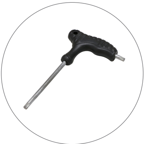
Qty 1 - Torx Key