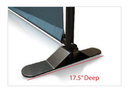
Sturdy Steel "Bridge" Support Base.

Graphic Turnaround Time is 2 business days for up to 2 sets