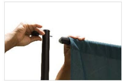
Clutch lock offers secure horizontal and vertical adjustments.