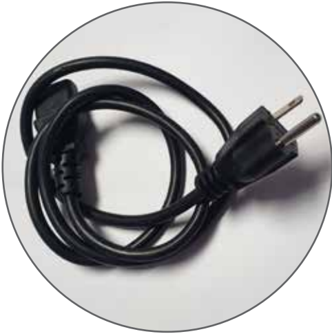
Qty.1 - UL Power Plug