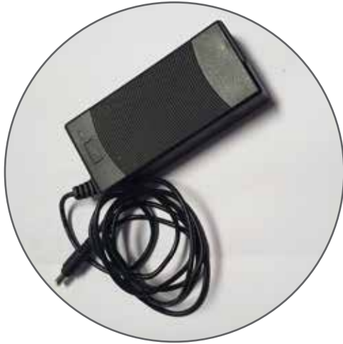
Qty.1 - AC Transformer