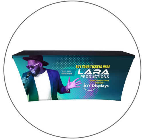
Qty.1 - 4 Sided Graphic w/ Full Color Front Side