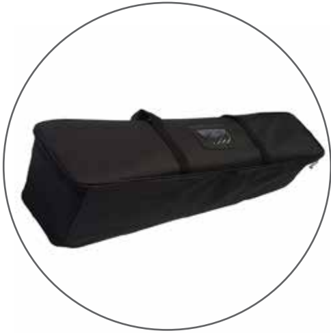
Qty.1 - Nylon Carry Bag