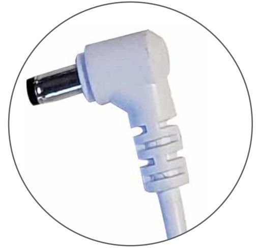
Qty.1 - 6' DC Cable