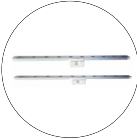
Qty.2 - 20w LED Strips