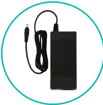
QTY 4: Transformers

• 5 1/8" L x 2 1/4" W x 1 1/4" H (Transformer) • 58" L (Cord Length)