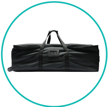
QTY 1: Travel Bag with Wheels