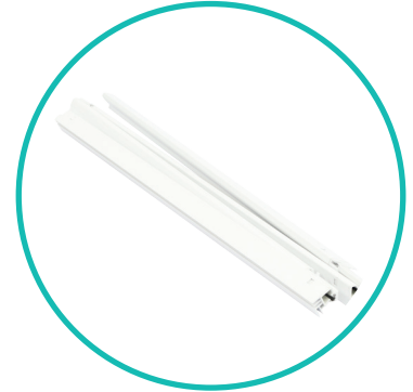
QTY 4: 4 Sectional Channel Bars