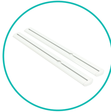
QTY 2: Stabilization Feet