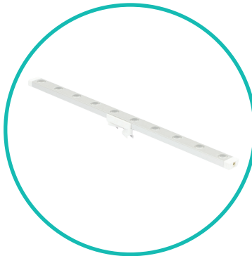
QTY 8: LED Lights

Outside Dimensions: • 28" L x 6" W x 7 1/4" H Inside Dimensions: • 28 1/4" L x 6 1/8" W x 6 3/4" H