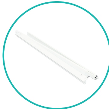
QTY 4: 3 Sectional Channel Bars