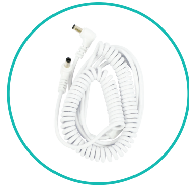
QTY 4: LED Light Jumper Cords