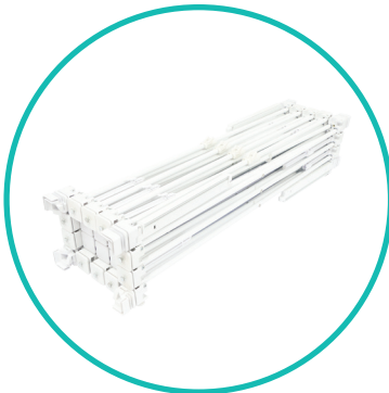
QTY 1: 4x3 Pop Up Frame