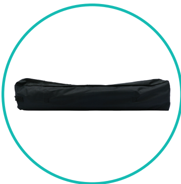
QTY 1: Channel Bar Bag