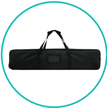
QTY 1: LED Light Travel Bag

Outside Dimensions: • 28" L x 6" W x 7 1/4" H Inside Dimensions: • 28 1/4" L x 6 1/8" W x 6 3/4" H