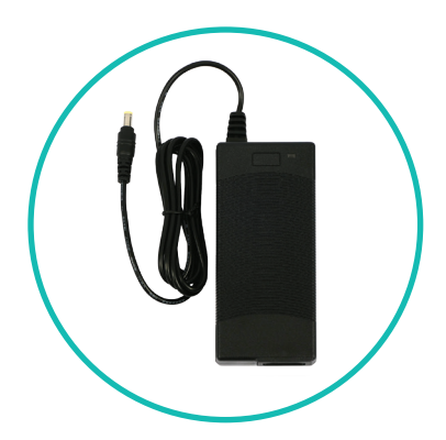
QTY 3: Transformers

• 5 1/8" L x 2 1/4" W x 1 1/4" H (Transformer) • 58" L (Cord Length)