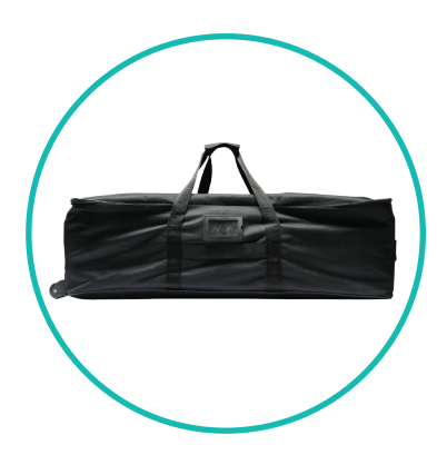
QTY 1: Travel Bag with Wheels

Outside Dimensions: • 35" L x 13" W x 10" H Inside Dimensions: