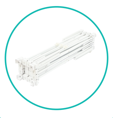
QTY 1: 3x3 Pop Up Frame

• 34 1/8" L x 6 1/2" W x 7 1/4" H (Collapse Frame)