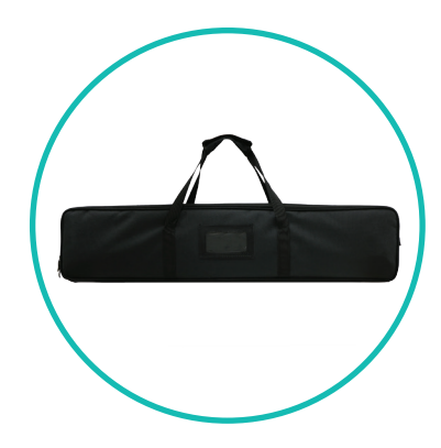
QTY 1: LED Light Travel Bag

Outside Dimensions: • 28" L x 6" W x 7 1/4" H Inside Dimensions: • 28 1/4" L x 6 1/8" W x 6 3/4" H