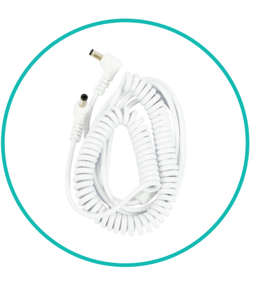
QTY 3: LED Light Jumper Cords