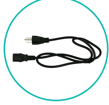
QTY 3: Power Cords

• 5 1/8" L x 2 1/4" W x 1 1/4" H (Transformer) • 58" L (Cord Length)