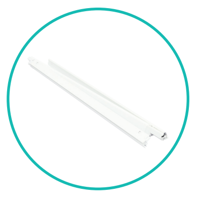
QTY 8: 3 Sectional Channel Bars

• 34 1/8" L x 6 1/2" W x 7 1/4" H (Collapse Frame)