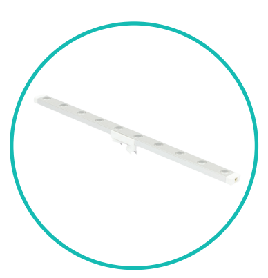
QTY 6: LED Lights

Outside Dimensions: • 28" L x 6" W x 7 1/4" H Inside Dimensions: • 28 1/4" L x 6 1/8" W x 6 3/4" H