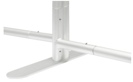
Double foot connection