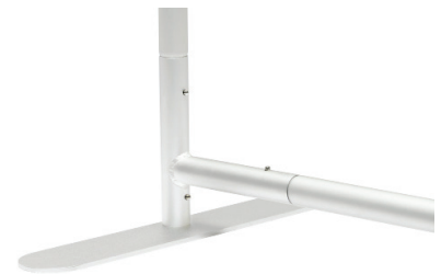
Single foot connection