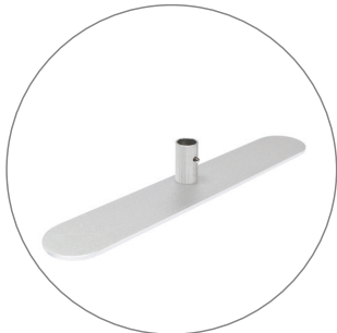
Single Foot ( 34mm) (qty 2)