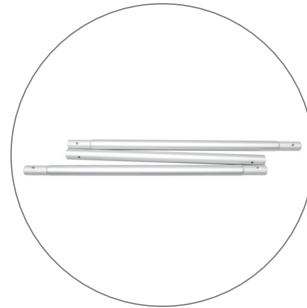
3 section 64" pole (qty 2)