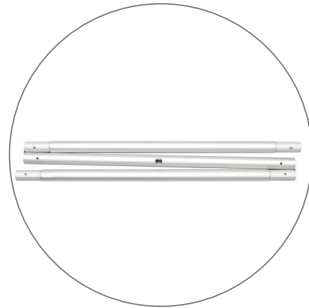
Bottom cross bar-10ft (qty1)