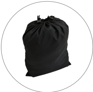
Soft Bag 8ft (qty 1)