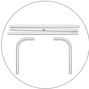
Top cross bar-10ft straight (qty 1)