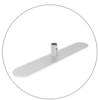
Single Foot (34mm) (qty 2)