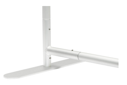
Single foot connection