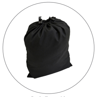
Soft Bag 4ft (qty 1)