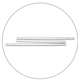
3 section 64" pole (qty 2)