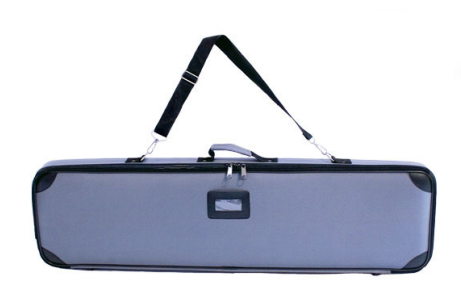
Optional 36" Silverbag Inside dimensions: 39"W x 10.5"H x 3"D