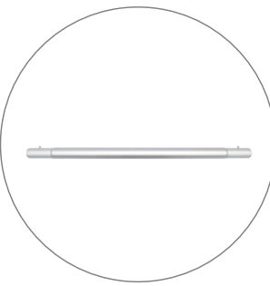
Bottom cross bar-4ft (qty1)