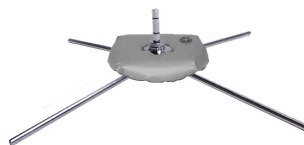
X-Base w/ optional water bag