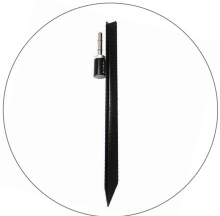
Triangle Spike Base FAL-TRI-SB