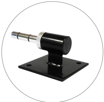
Fixed Mount - 0 Degree FAL-FM0D