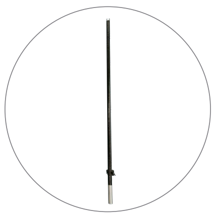
(qty 2) Base Poles