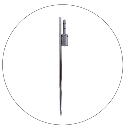
(qty 2) Spike Base SKU: FAL-SB