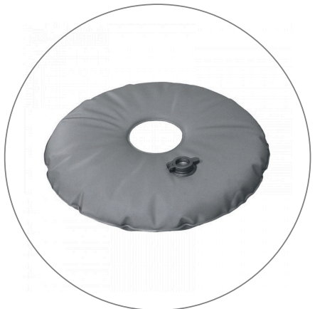
Water Bag WBAG