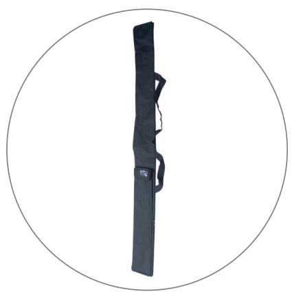
(qty 1) Travel Bag