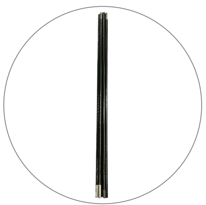
(qty 1) Middle Pole Set (Bungeed Together)