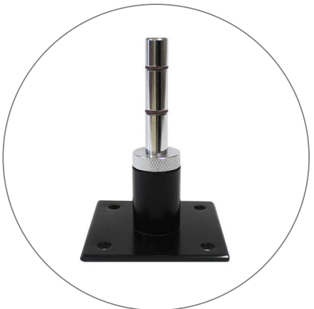
Fixed Mount - 90 Degree FAL-FM90D