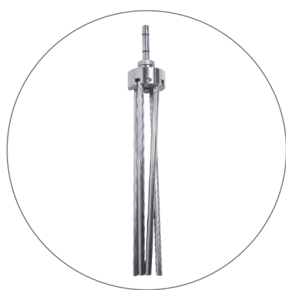
(qty 2) X-Base SKU: FAL-XB