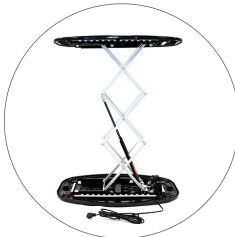
(qty 1) Gopher Pop Up Backlit Frame