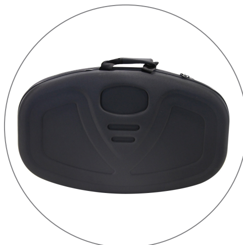
(qty 1) Travel Bag