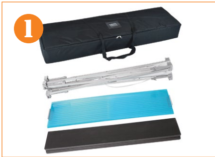
1. Take out the hardware from the bag.