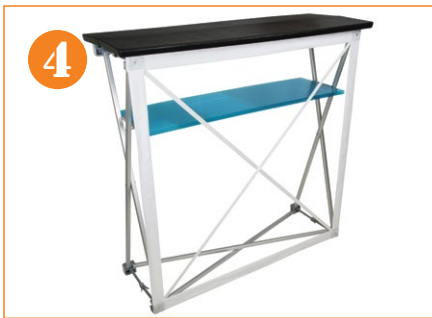
4. Place the board on top of the counter.