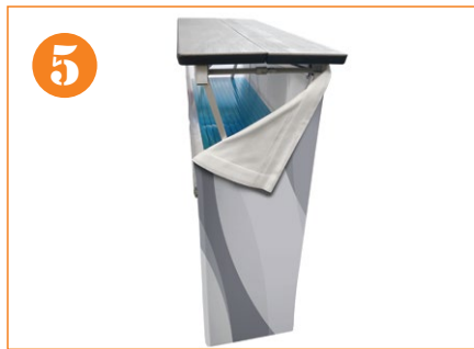
5. Attach the graphic around the velcro.