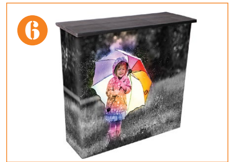
6. Completed LEAP pop up counter with graphic.