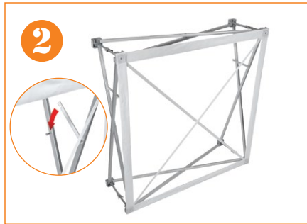
2. Open the frame