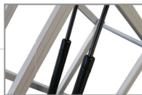
Patented hydraulic cylinder design