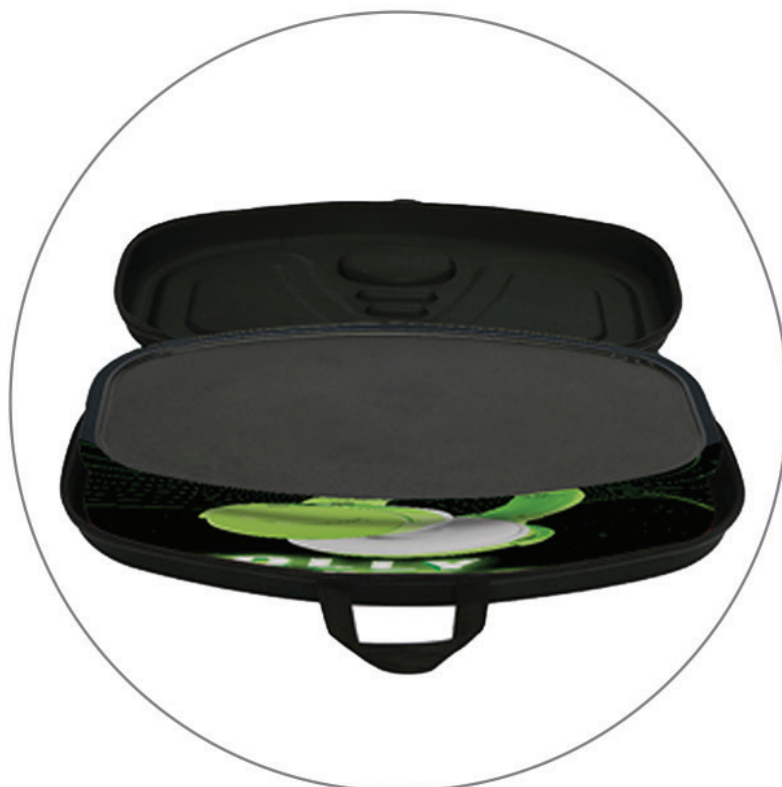
Carry bag with frame and pre-installed graphic