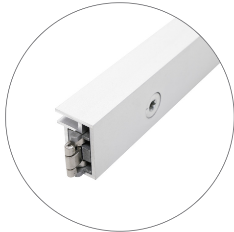
Qty 8 - 40CG Horizontal Extrusions