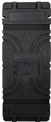
Wheeled Case (included)