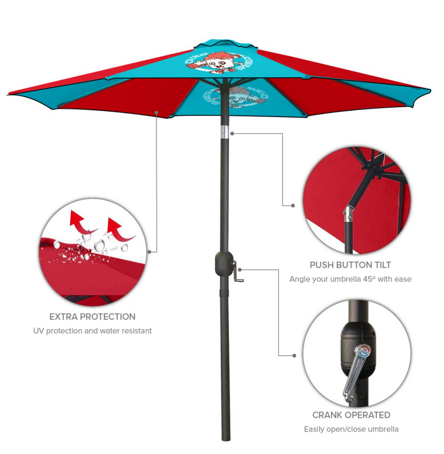
Shown with black trim