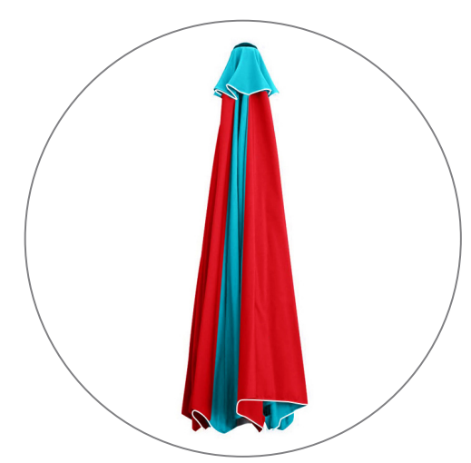
Umbrella Ribs w/Top (Top is installed prior to shipping) (qty 1)