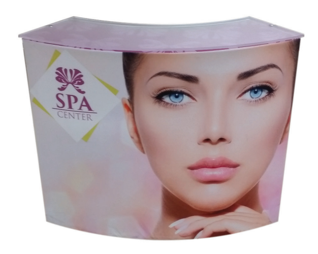
The install is now complete.