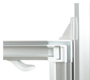
LOW HIGH CONNECTION