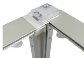
90° CORNER CONNECTION