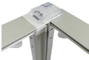
90° CORNER CONNECTION