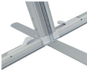
DUAL FOOT CONNECTION