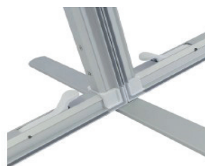
DUAL FOOT CONNECTION