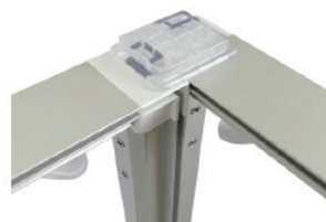
90° CORNER CONNECTION